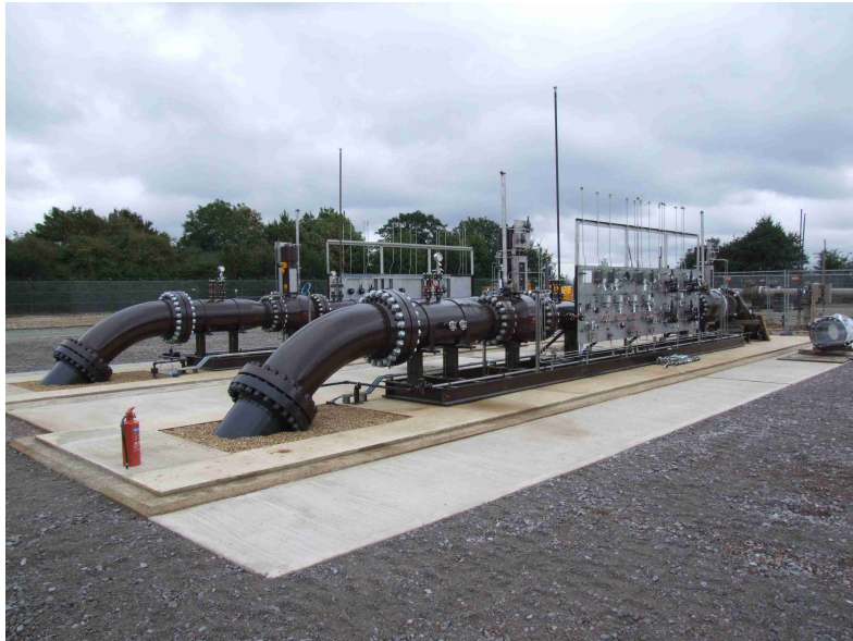
Example of an Above Ground Installation, Google

We would also build a small number of Above Ground Installations ('AGIs') along the route for operational and maintenance needs. These will be located in compounds approximately 80m x 70m in size. They will be very similar in appearance to natural gas pipeline AGIs.